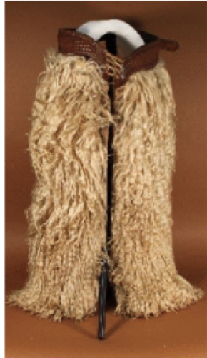
Drop front "white woolies" (Witte)