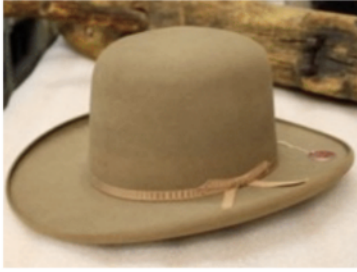
Stetson cowboy hat, late 1800s (Witte)

The lives and legacies of Black cowboys have inspired new generations to explore the past through music, film, fashion and design. Black Cowboys: An American Story concludes with a multimedia look at the latest pop culture moments that have been influenced by the stories of Black cowboys.