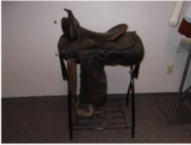
Texas saddle, made in late 19th century (From the Collection of the Black Cowboy Museum)